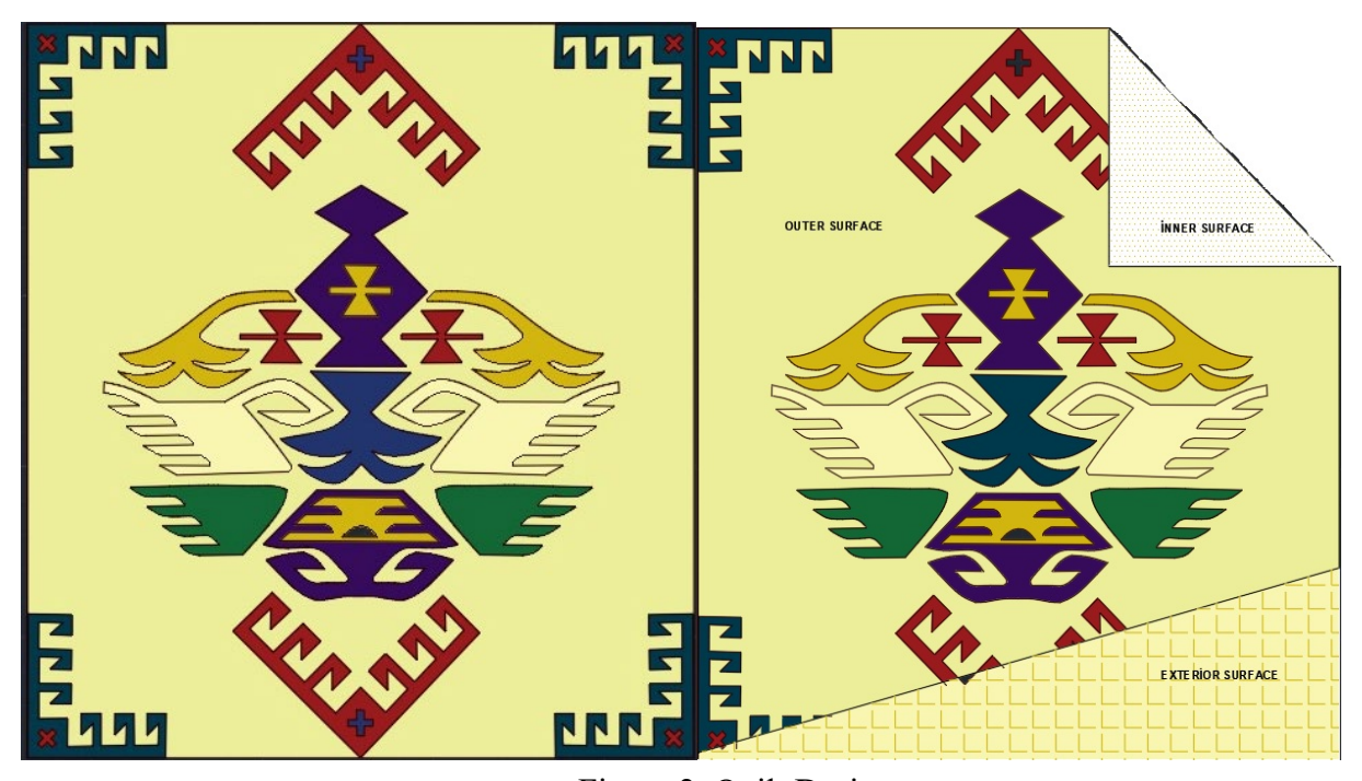
Figure 2. Quilt Design