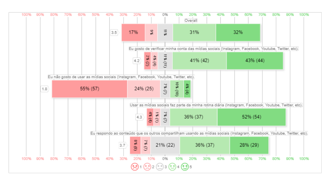
Figure 5. Results of the scale of use of social media by respondents