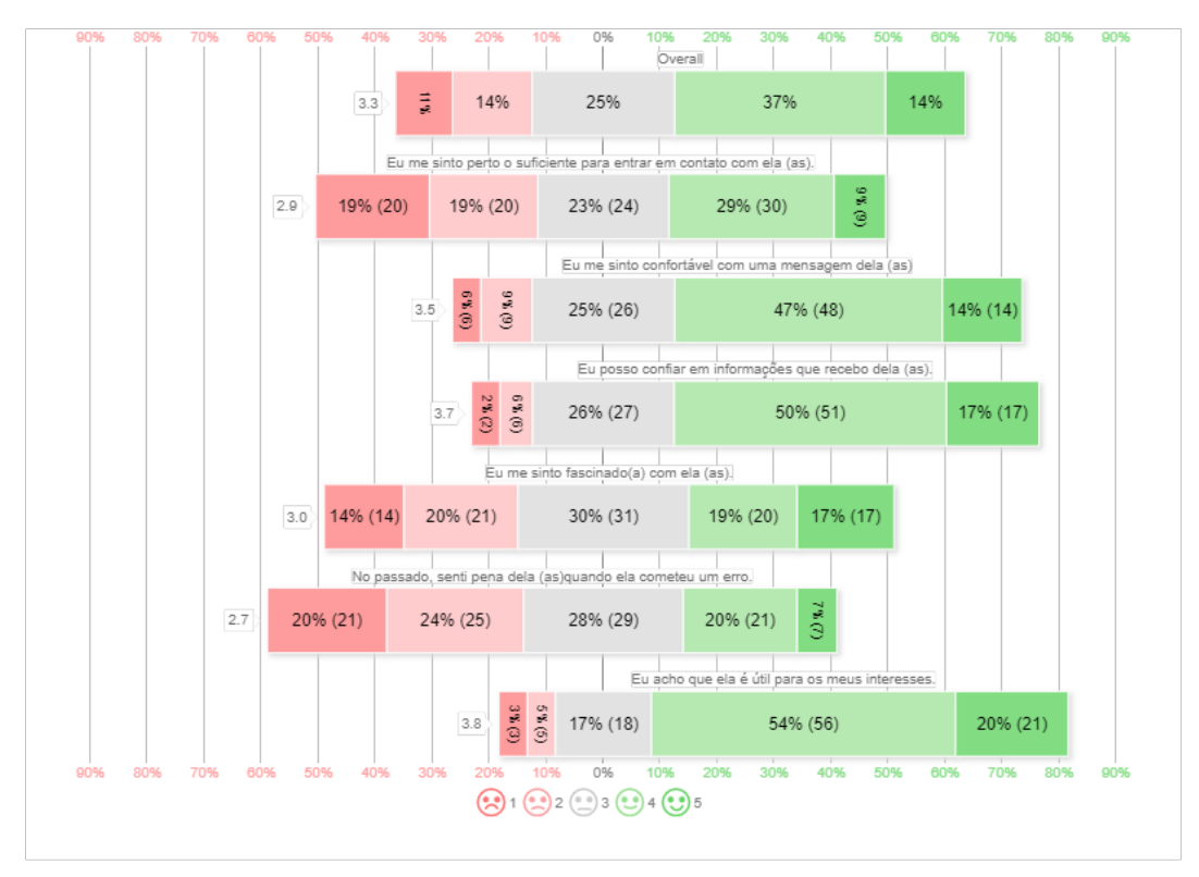
Figure 4. Results of the parasocial relationship scale with digital influencers

In the fifth section, data were collected on the degree of agreement based on the interviewee's perception of their proximity to fashion influencers from Caicó (Rio Grande do Norte). In this context, it identified a level of 51% agreement (Figure 4).