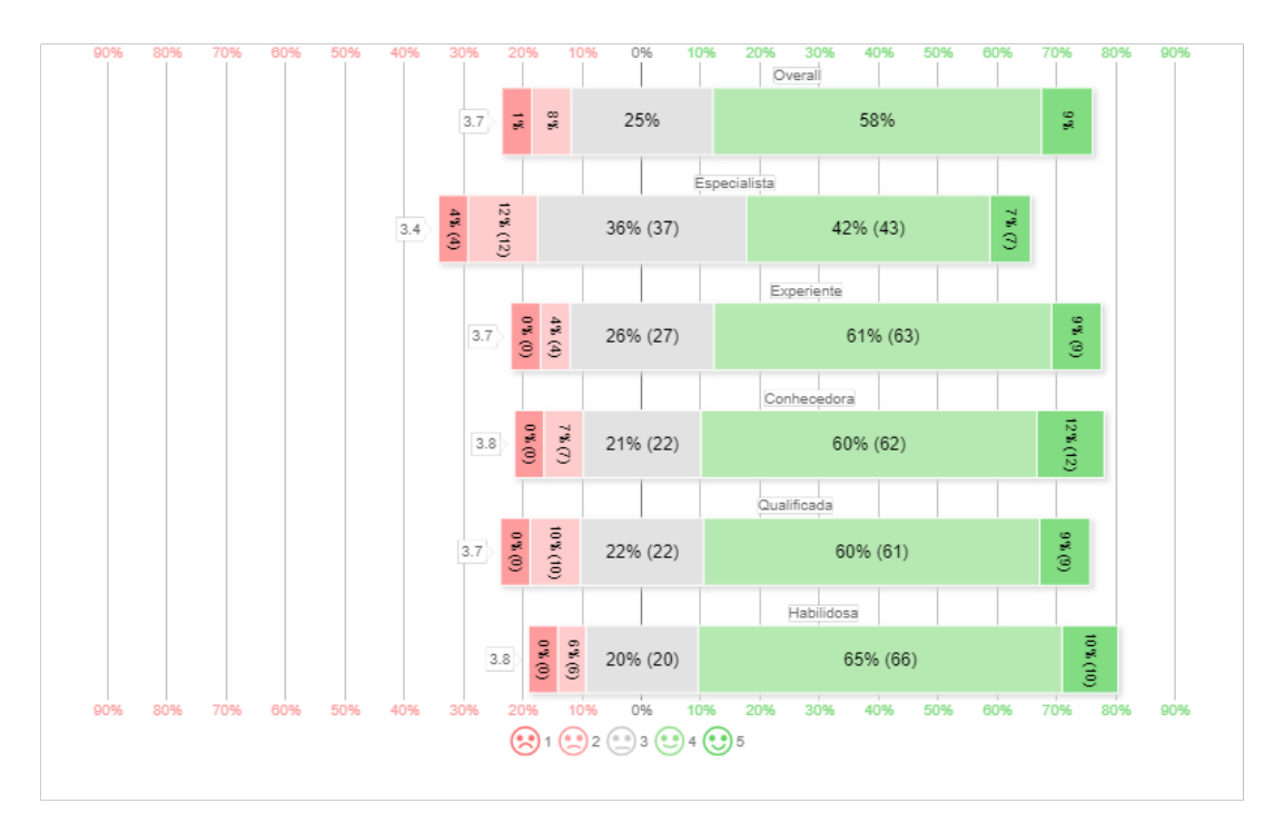
Figure 3. Results of the experience scale of digital influencers

Concluding the fourth section, it is questioned the level of experience the digital influencers most seem to have. Regarding this dimension, respondents expressed 67% agreement (Figure 3).