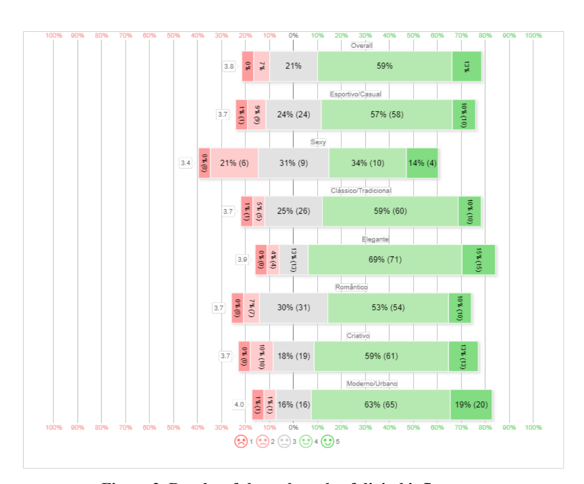
Figure 2. Results of the style scale of digital influencers

Still remaining in the fourth section, they should select the styles that best fit with the digital influencers that were mentioned in section 3. The styles that stood out the most were elegant, creative, and classic/traditional. Meanwhile, the least mentioned were sexy and romantic (Figure 2).