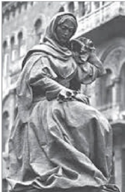
Fig 2. O. Eldarov "Khurshudbanu Natavan"(1960)

The work of Tahir Salahov, one of the famous Azerbaijani artists of our time, and especially his works on oil, were presented. The illustrations of the artist's works "Next-door visitors", "Repairmen", "Caspian morning" are also placed on the topic, and information is given about the "hard style" that he founded. T. Salahov's harsh images of the oil workers are discussed in the fine arts textbook, which express the fate of workers, the simplicity, tenacity, and kindness of their nature. In the artist's triptych "Traditions and Modernity: Home of Fires", the celebration of Azerbaijan, the history of our architecture from ancient times to the present day increases the outlook of IX class.