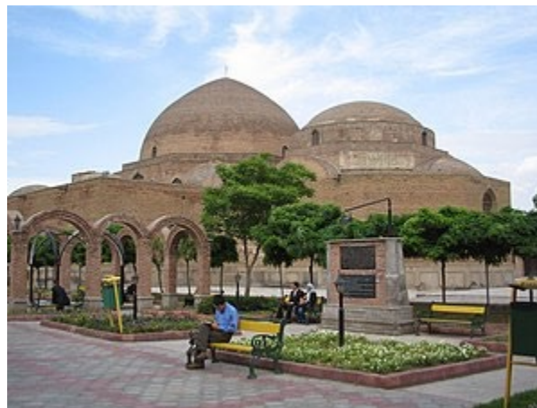
Fig 2. Blue mosque, Tabriz. 1465

In secondary schools, fine art textbooks also provide extensive information about miniature painters. The works, styles and techniques of Muzaffar Ali, one of the brightest representatives of the Tabriz miniature school, are presented in a special table.