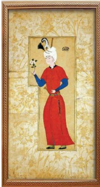
Fig. 3. Muzaffar Ali "Young prince with flowers"

https://www.icssietcongress.com/icel-2023