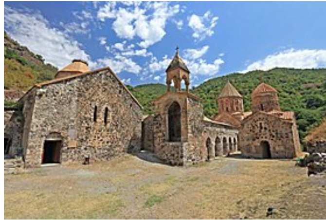
Fig 1. Khudaveng monastery complex. VI-VII centuries. Kalbajar

https://www.icssietcongress.com/icel-2023