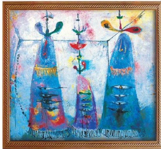
Fig. 4. Rasim Babayev "Refugees' houses"

https://www.icssietcongress.com/icel-2023